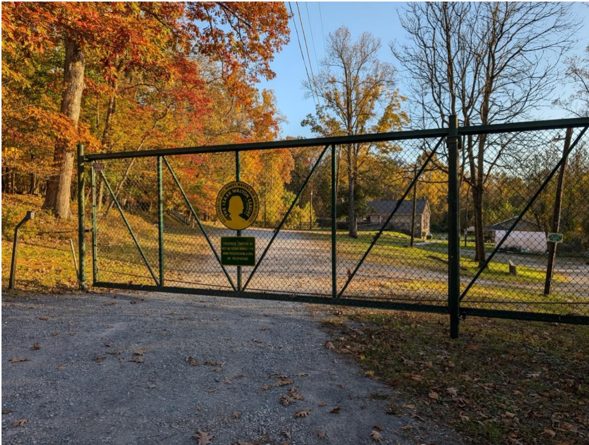
View of the gate and driveway circle in front of the IWLA Frederick #1 Chapter clubhouse.