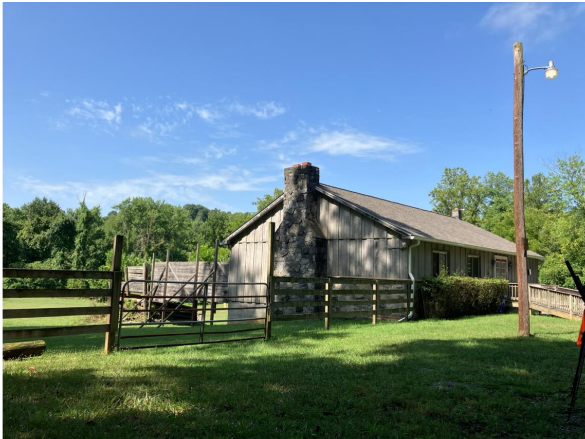
IWLA Frederick Chapter Clubhouse East Side August 2024

24 Aug – Invasive Plant Removal Conservation Project, 8am 26 Aug – Save Our Streams (SOS) Testing, 10am 27 Aug – Frederick County Sportsman’s Council, 7pm 31 Aug – Invasive Plant Removal Conservation Project, 8am