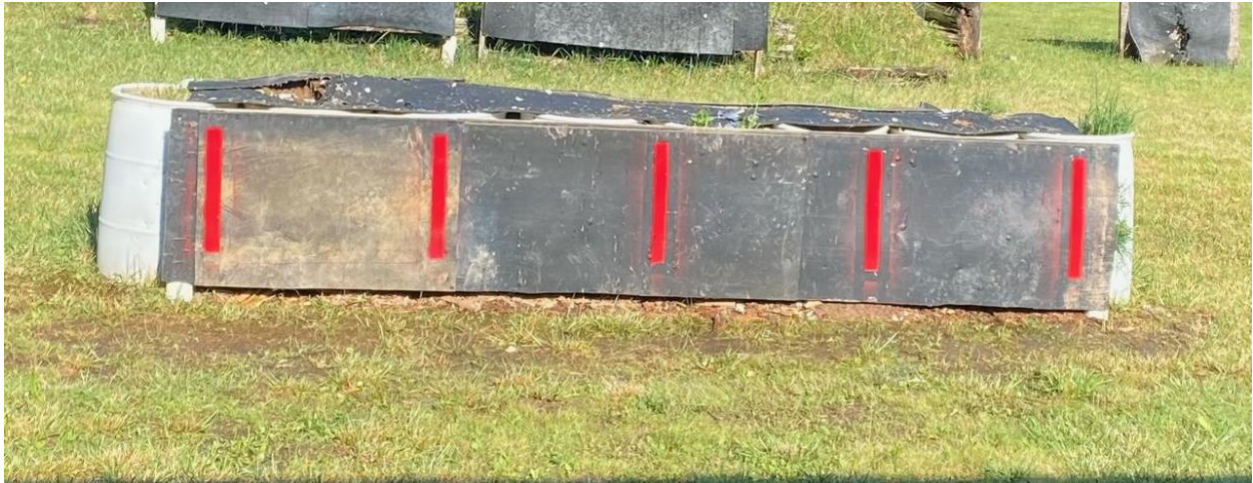
The pistol range backstop was refurbished by Ikes Jeff Pearson and Dave Carlson

Installed on the pistol range backstop are red lines that are placed directly over the vertical supports holding up the frame. The top and bottom of the red lines indicate where the top & bottom horizontal supports are.