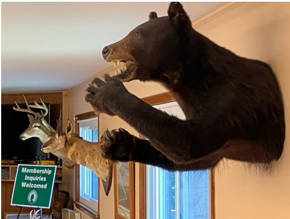
IWLA Frederick #1 Chapter Membership Inquiries Welcomed