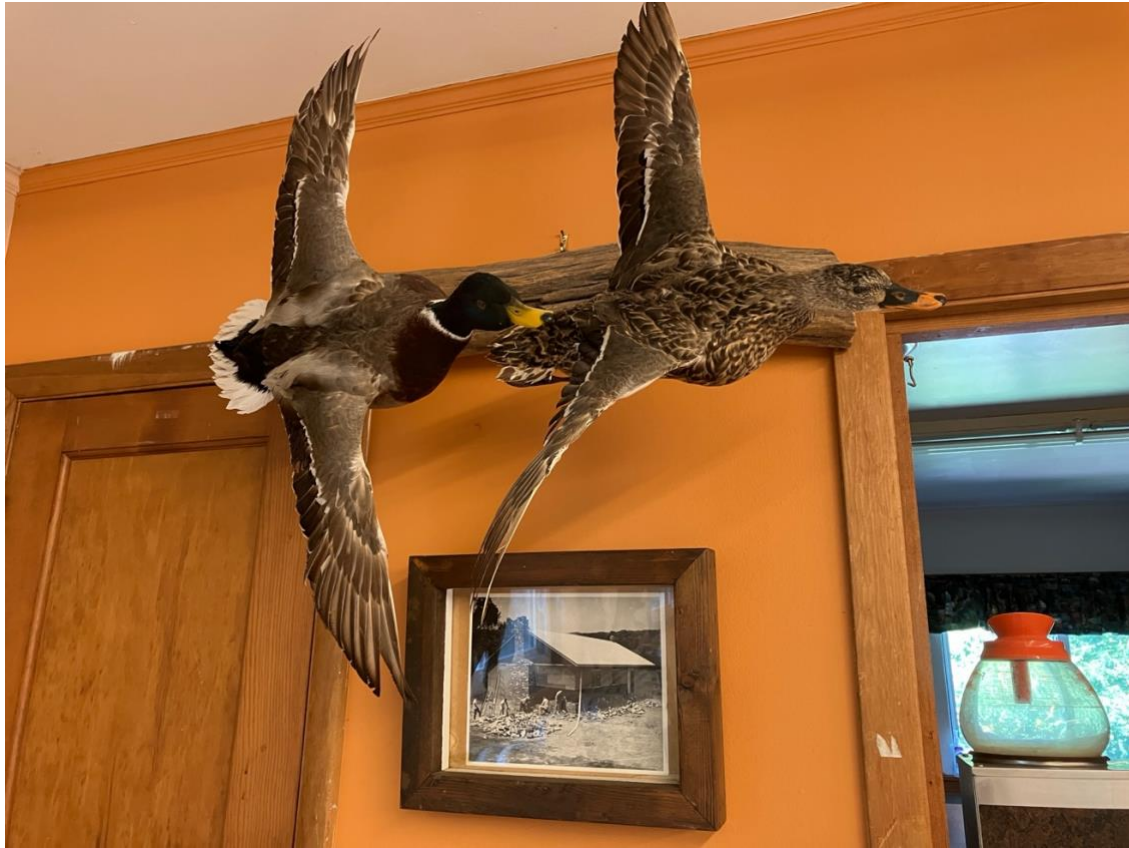
Mallard Duck Display and picture of IWLA Frederick Chapter Clubhouse circa 1962