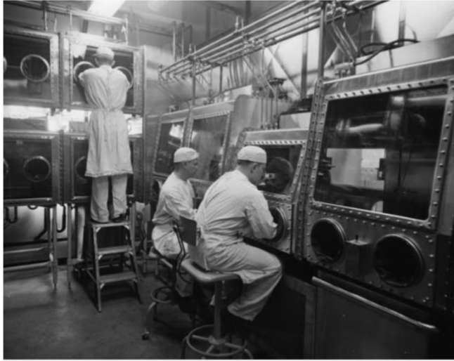
Technicians work in a laboratory at Fort Detrick in Frederick, Md., in the late 1960s under the offensive biological weapons program that the Army ran there from 1943 to 1969.

medical, and radiological waste, according to the Environmental Protection Agency.