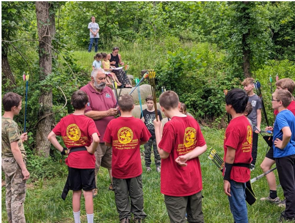
Archery instruction at the Chapter Youth Group practice. Our Chapter Youth Group is preparing for the Youth Hunter Education Competition at Williamsport, Maryland June 21-23, 2024.

15 June - Range Safety Officer Class, 7:30am 16 June - Youth Group Practice 12:30pm 21-23 June – Maryland Youth Hunter Education Competition, Williamsport MD 25 June – Frederick County Sportsman’s Council, 7pm 29 June – Save Our Streams (SOS) Testing, 10am