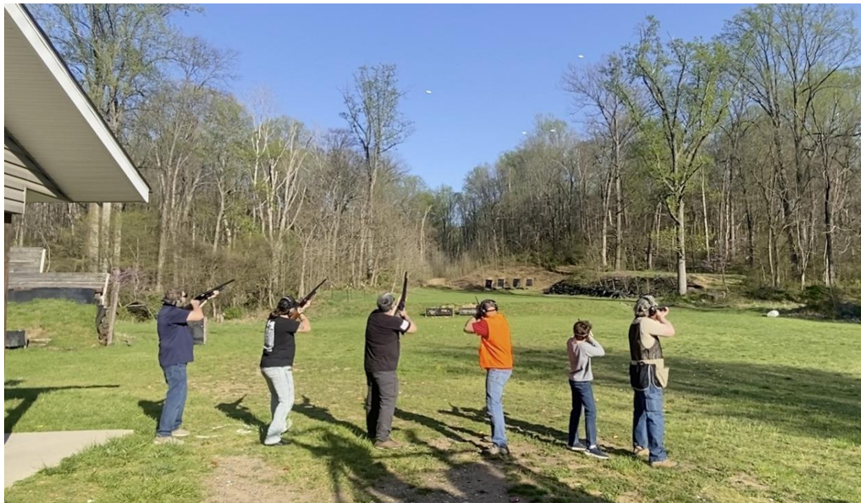
Sporting Clays Social Event at the Frederick IWLA Range, April 14, 2024