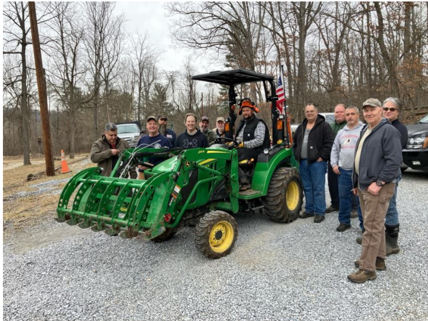
IWLA Frederick #1 Ikes completing Conservation Trail maintenance and property silviculture work, Feb 10, 2024.

In this week’s newsletter: Chapter News, Conservation Trail maintenance, Defenders Award, IWLA National Convention, environmental concerns from mega data center development, Frederick #1 Chapter charter date, Forest Stewardship Plan, Save Our Streams, conservation programs starting up, Chapter education classes, and more.