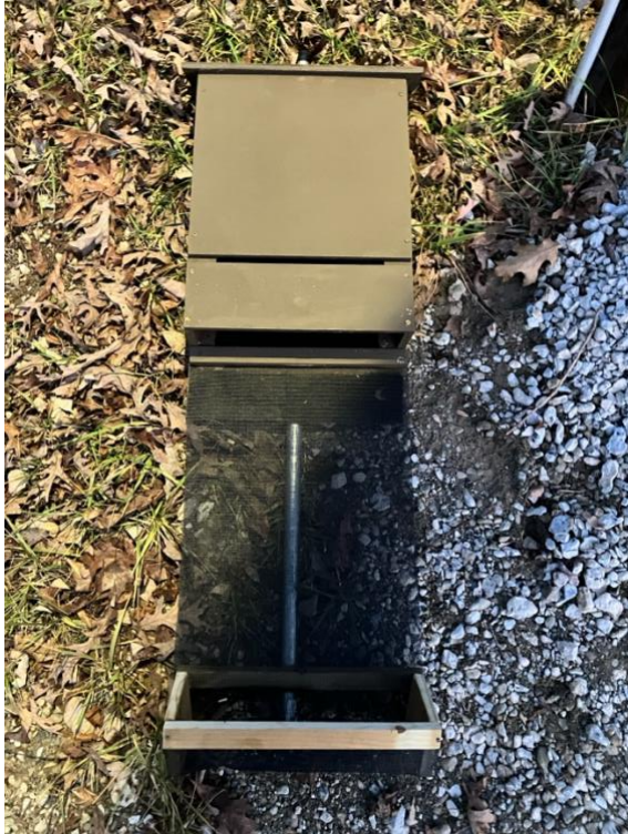
Bat box habitat for Life Scout Luke Reyna's Eagle Scout Project on the ground showing ventilation ports and mesh pup catcher.